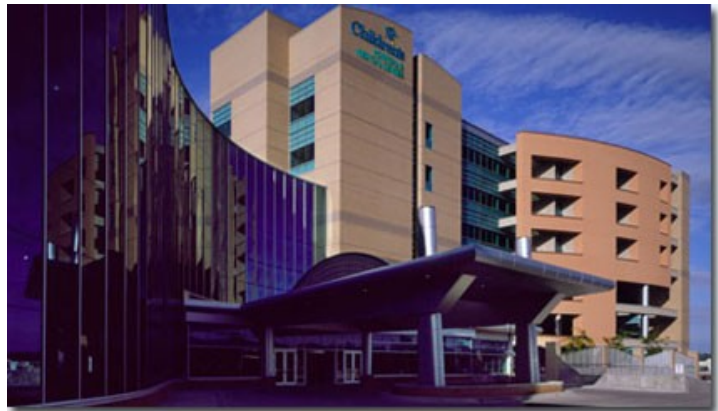
CHILDREN'S HOSPITAL & MEDICAL CENTER - OMAHA, NEBRASKA